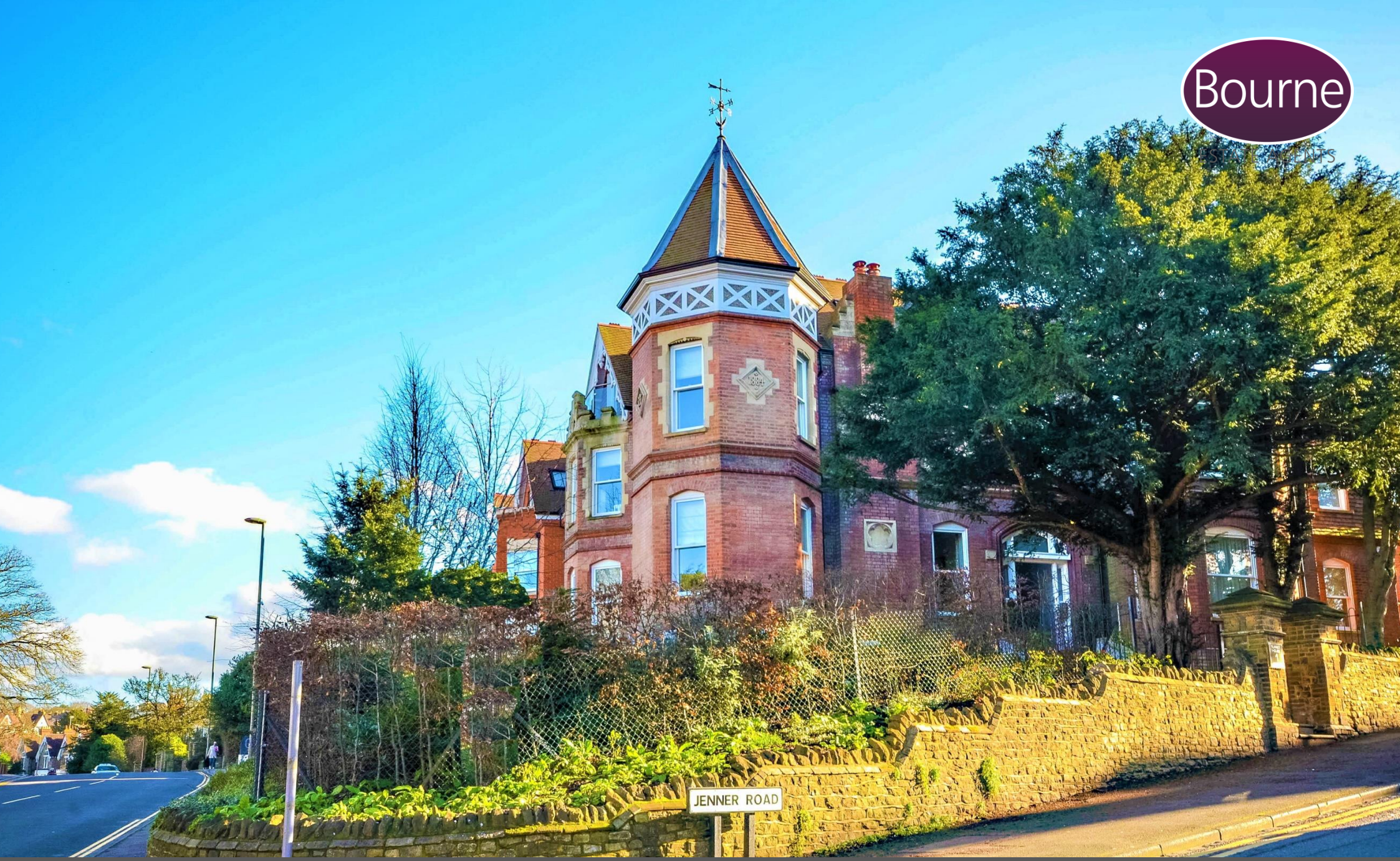
Turret House, 1 Jenner Road, Guildford, Surrey, GU1 3PH