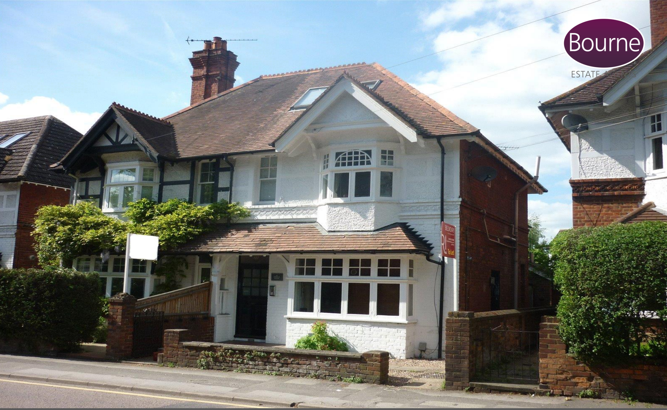
Vernon House, 25 York Road, Guildford, Surrey, GU1 4DN